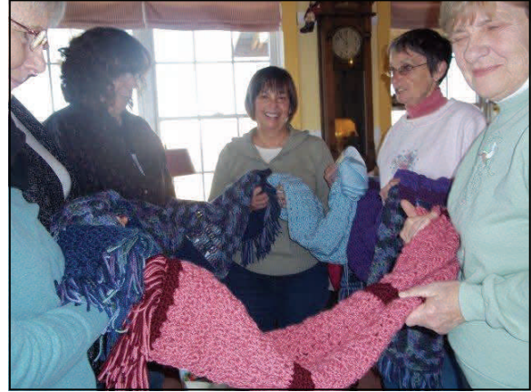
Blessing a shawl.

Some knit scarves, sweaters, socks and wash cloths. A couple of them knit and crochet prayer shawls for a community organization that wants to make sure everyone who is sick, dying or